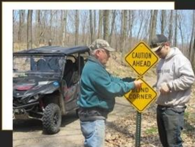
Photos of the trail work that took place on May 9 th

Old business: Opening of County highways - Oneida County Highway Dept has opened Hwy K, C, P, and G into the city. Be aware not all city streets are open to ATV/UTV usage. Lincoln St. and N. Stevens St. from the BP gas station north are closed.