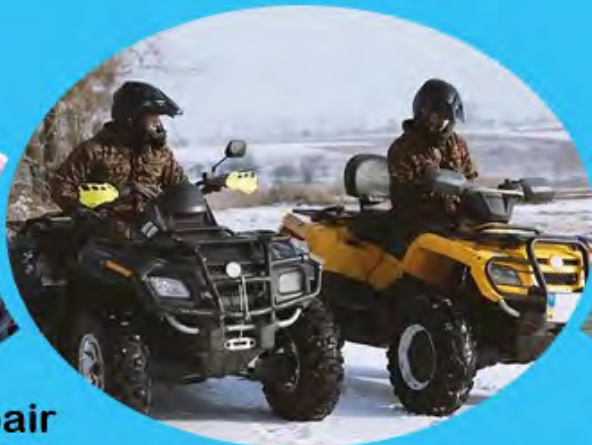
ATV – UTV Repair