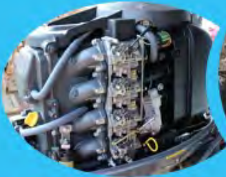
Boat Motor Repair

Routine Maintenance Or A Full Engine Overhaul, We Are Here To Help!