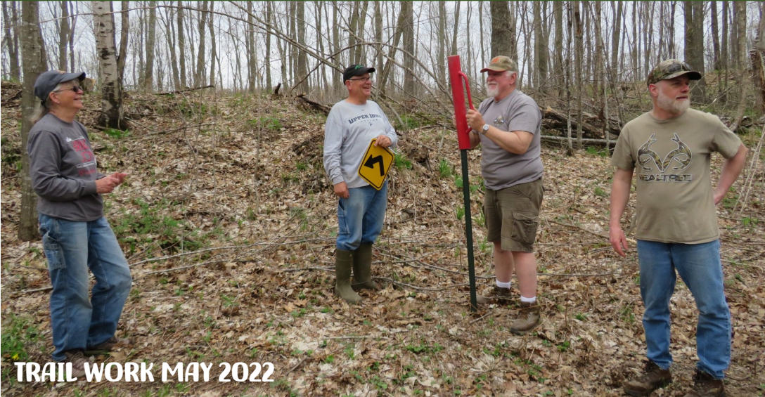
TRAIL WORK MAY 2022