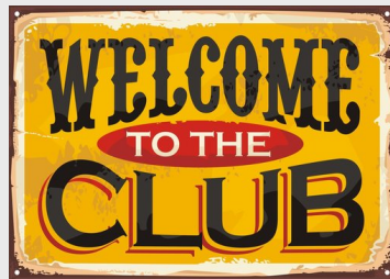
Oneida County Fair