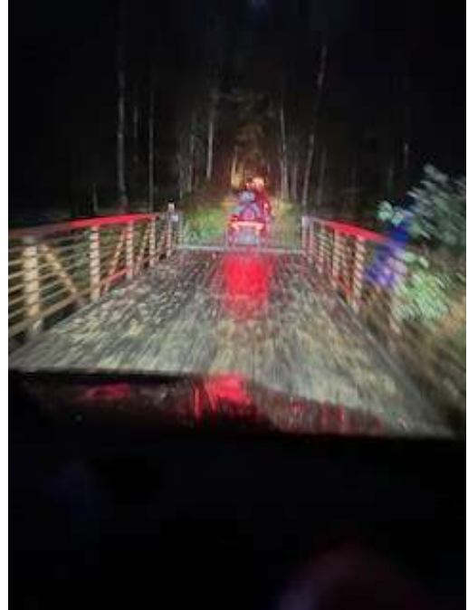
The bridge over Noisy Creek