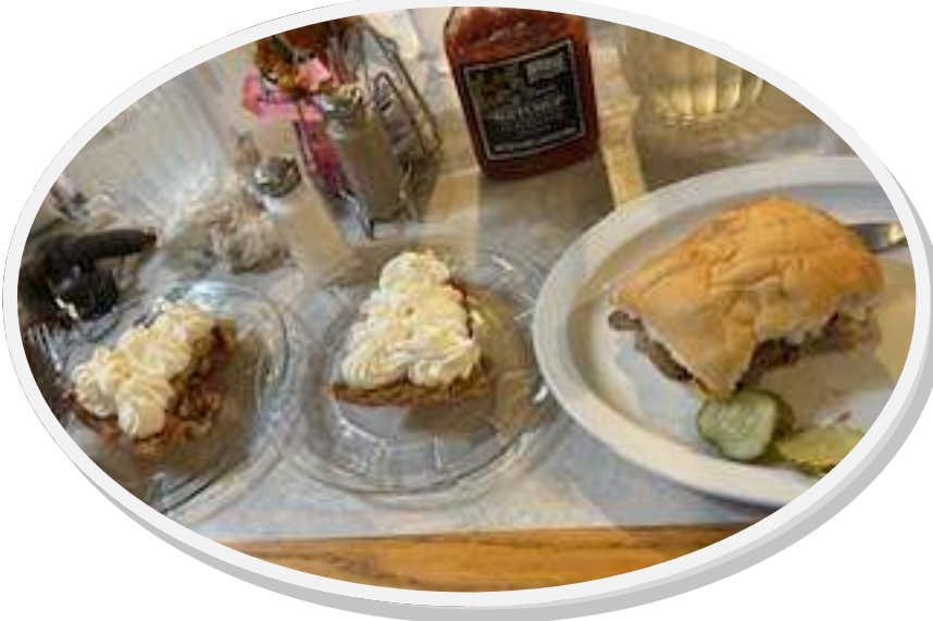
Birthday Pie (Strawberry Rhubarb) at The Prime Mmmm... Yummy!!!