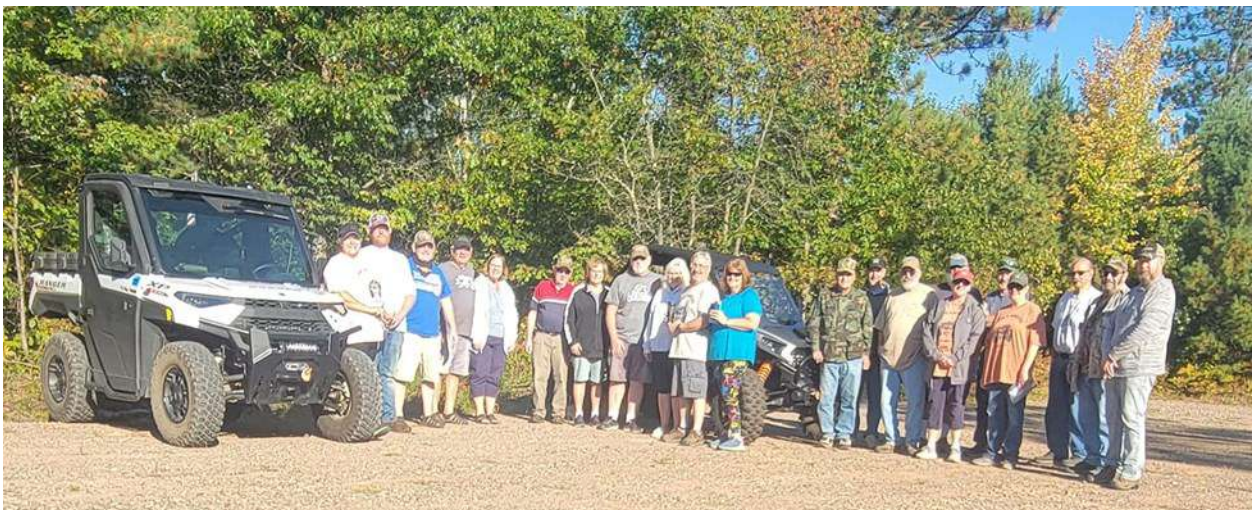
Our Hodag Group