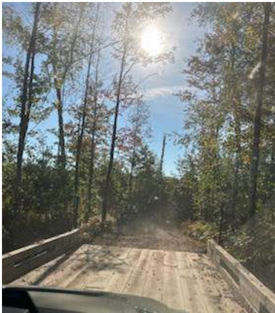
Bright, sunny day

Follow Facebook for details and plan to join us in the fun.