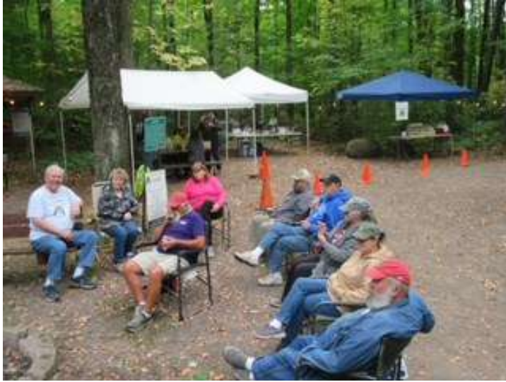
Enjoying the campfire...