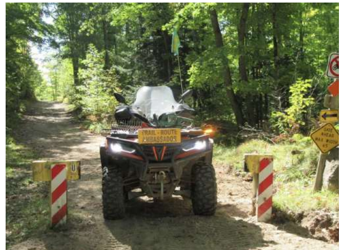
Stefanez Rd. gate is more level now.