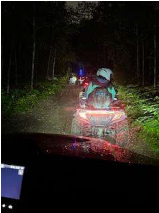
It was dark and damp, but fun!!!