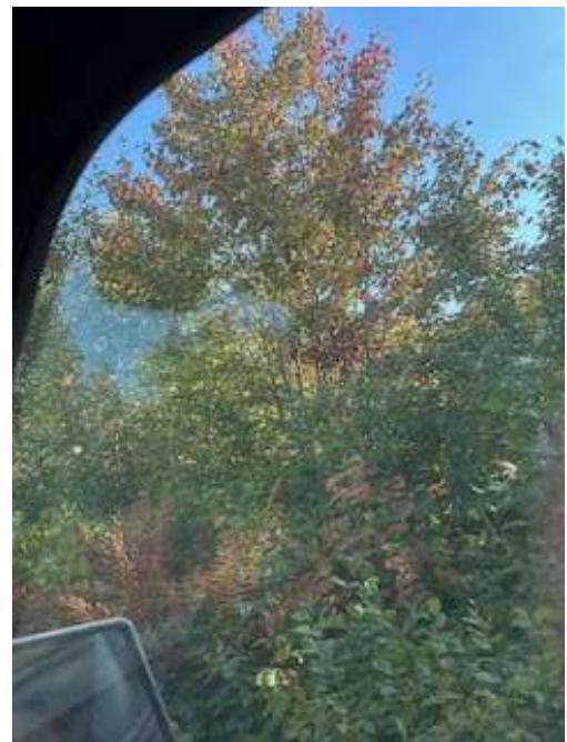
Fall colors starting