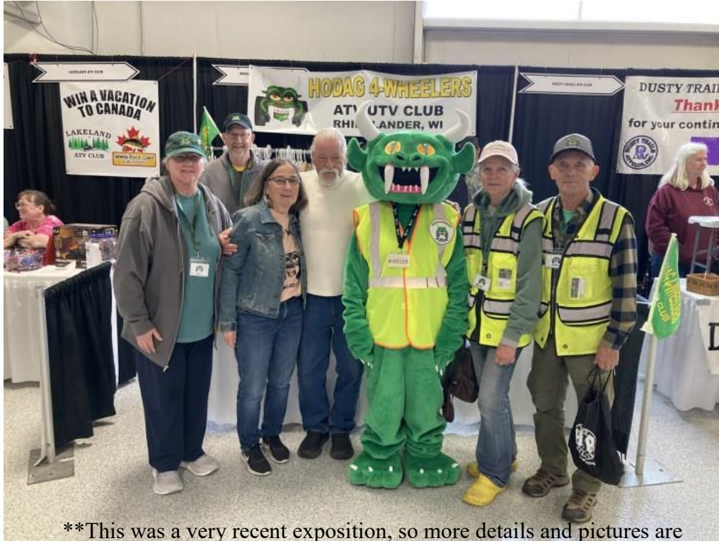
**This was a very recent exposition, so more details and pictures are sure to come in the next newsletter!!!